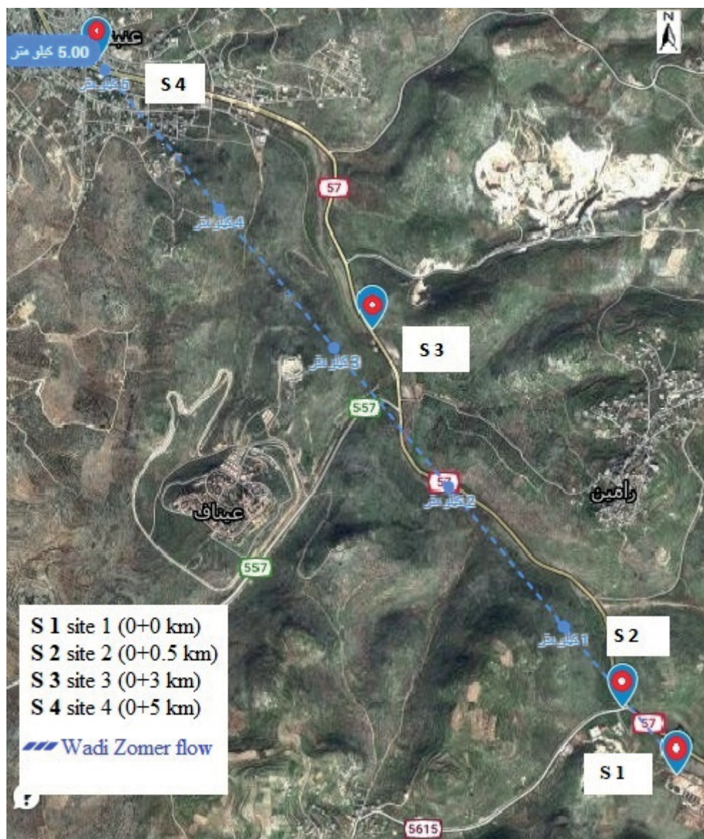
Fig. 1. Study area and sampling sites along Wadi Zomer (not to scale).

These parameters included temperature (T), pH and dissolved oxygen (DO) using WTW OXI 7310 (WTW, Germany), electric conductivity (EC) with Mettler Toledo (Seven Excellence, USA). Directly after sampling, water and sediment from Wadi Zomer were subjected to analysis following the standard methods [22]. Major parameters total suspended solid (TSS), total phosphorus (TP) by ICP Avio 200 (Perkin Elmer, USA), biochemical oxygen demand ( BOD_5 ), chemical oxygen demand (COD), ammonium ( NH_4-N ) by Spectrophotometer Lambda 25 (Perkin Elmer, USA) and nitrate ( NO_3-N ) by HPLC (Dionix Thermo, USA) in water and sediment in accordance with the standard methods [22]. Vegetation samples from leaves, stem and roots were analyzed for selective heavy metals (Zn, Fe, Mn, Cu, Ni, Pb, Cr). 1 g of dry weight of each sample was digested using the following digestion mixture (Conc. HNO_3 , H_2SO_4 , H_2O_2 )