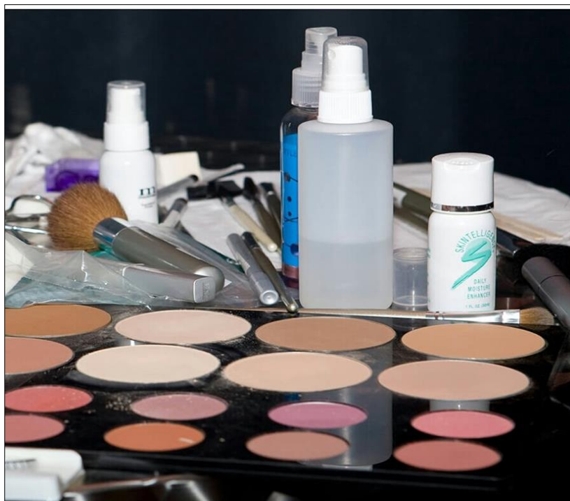
Figure 2 Facial cosmetics

used for skin lightening. It causes decline in the production of melanin pigments. It is carcinogenic and the reduction in melanin increases the risks of cancer due to reduced protection against UV rays. Hydroquinone affects natural immunity and also brings about reproductive and developmental defects [3]. Parabens are used in cosmetics to inhibit microbial growth while in storage. They are carcinogens and are easily absorbed by the skin and enter the bloodstream and the digestive system. Phthalates are used as binding agents for colour and scent in cosmetic products. They disrupt human hormonal system [3]. Aloe vera , neem and olive oil are the herbal ingredients commonly used in cosmetics and whose demand is increasing [16]. Cosmetics can either be herbal or synthetic depending on the ingredients from which they are made and either will serve the purpose of cosmetics [10]. The former however, are milder, biodegradable and have low toxicity profile [4]. Further, they whip up the circulation, refine the pores, refresh the skin leaving it soft and glowing and promote the skin's capacity to absorb. [9]. Herbal cosmetics have preventive, protective, corrective and curative actions ideal for maintaining the health of the skin.