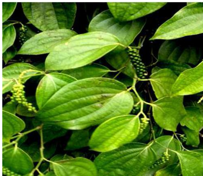
Figure 1: Black pepper plant ( Piper nigrum L.) [7]

Morphologically, the pepper plant is a perennial that climbs and spreads (Figure 1). The stem is broad, and it has knuckles—a plant height of up to 10 meters and a crown diameter of up to 1.5 meters. Pepper plant parts include roots, stems and branches, leaves, flowers, fruit, and seeds [8].