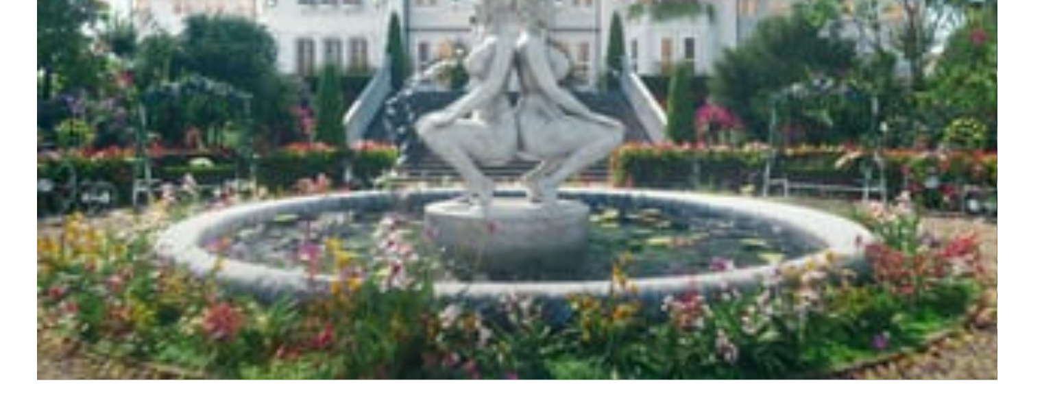
Screenshot: Flowers and fountains in WAP (2020).