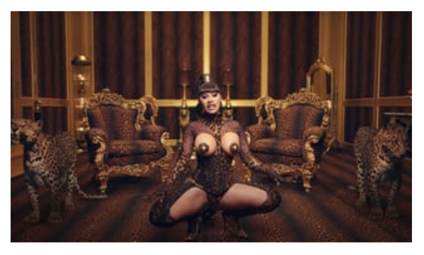
Screenshot: Cardi B and leopards in WAP (2020)

and snakes. Dressed in Bryan Hearns' army green and mustard yellow moulded snake leather bras and cage corsets, they begin to sing and rap of what they require to achieve 'wet ass pussy'. The video and the song progress through cuts between these different presentations of the two women—from the snake pit back to the wonderland hallway to a cartoon industrial interior and back again. In each location, designer fashion complements the backdrop—in the industrial space the women wear sheer lime green and purple Mugler bodysuits and over-the- knee boots; in a boudoir Cardi sports another custom Mugler leotard in leopard print with what must be the most amazing nipple covers ever featured in a popular media video, while Megan sports a Zigman corset to match the Bengal tigers in a bathroom scene. Latex outfits from fetish couturier Venus Prototype adorn the singers and their backing dancers in the waterpool, and vintage Alaia makes an appearance when Normani dances her solo. Alongside Normani's cameo, four other female artists—Rosalía, Mulatto, Sukihana, and Rubi Rose—are featured. Their appearances are important statements of connection and collaboration in an industry which has pitched female artists as perpetually in competition with each other. Plus, and somewhat incongruously, Kylie Jenner struts the hallway dressed in a leopard print gown by Puerto Rican designer Rey Ortiz.