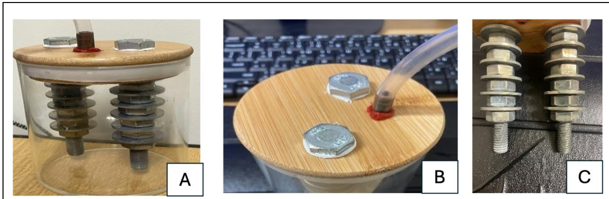
Figure 1: (A) container, (B) Cover, (C) Stalin-steel Electrodes.

The container is designed to hold up to 250 mL of water. It features an inner radius of 3 cm and an outer radius of 3.5 cm, with a height of 8 cm. The wall thickness of 5 mm ensures sufficient durability while maintaining a compact form factor. The material used is glass, chosen for its high thermal resistance and not conductive. The cover is a critical component for sealing the container and housing the inlet and outlet ports. It has a height of 1.5 cm and matches the container's radius dimensions. The cover includes three holes: two side holes with diameters of 12 mm, and a central hole with a diameter of 6 mm. These openings facilitate gas exchange while maintaining the integrity of the system. The electrodes are made of stainless steel with a height of 6 cm and the same diameter as the holes in the cover to fit inside perfectly. It has washers and nuts to increase the surface area of the electrodes and increase the process.