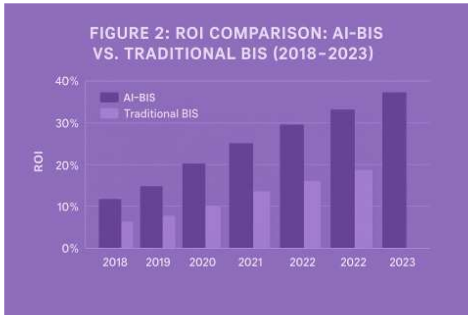
Figure 1. ROI Comparison: AI-BIS vs. Traditional BIS (2018–2023)