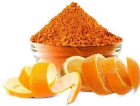
Fig. 1 Orange Peel Powder