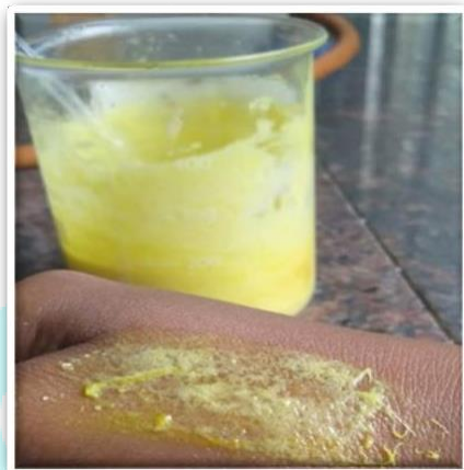
Fig. 5C after 15 minute