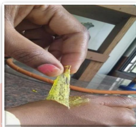
Fig. 5D At the removal of mask