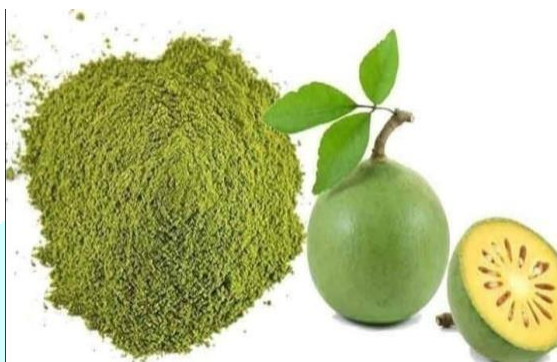
Fig. 1 Bael Fruit