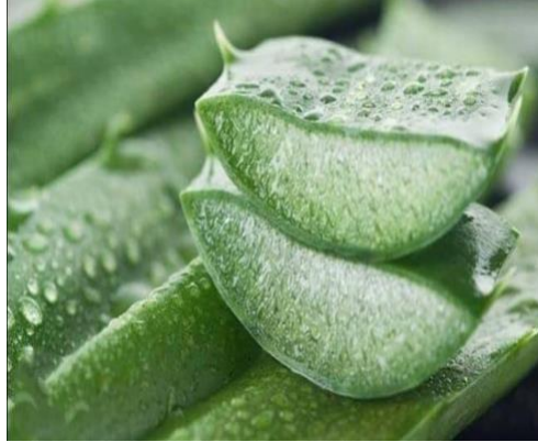
Fig. 4 Aloe Vera