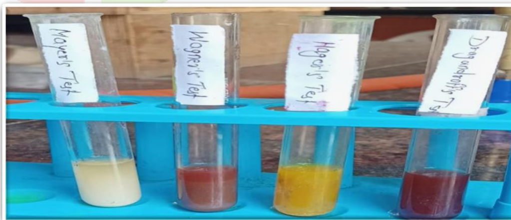
Fig. Alkaloid Test