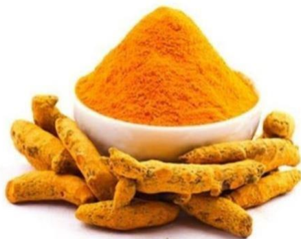
Fig.3 Turmeric Powder