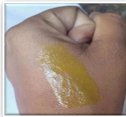
Fig. 5B Apply peel of mask