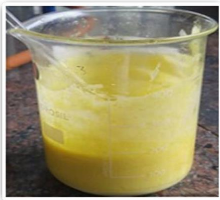
Fig. 5A Prepared formulation