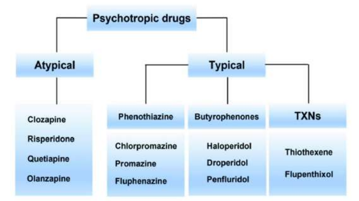
Fig. No 01 Psychotropic Drugs

Various Drugs Of First- And Second-Generation Antipsychotics Approved By Fda (Food And Drug Association): <sup>[5]</sup>