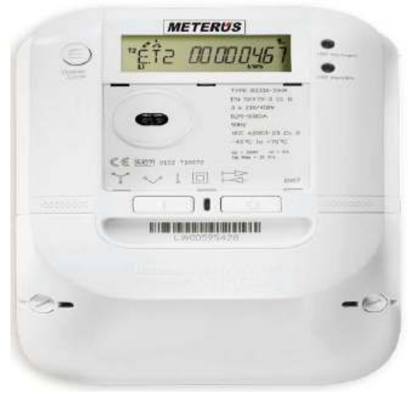
Figure 1:-Smart Meter

Smart meters are advanced meters that identify energy consumption in more detail than a conventional meter which is shown in the fig.1. The technology used is far more advanced. They have the ability to communicate information via a second network back and forth between your homes. Smart meters are foundation for updating existing electrical system into smart grid because they have two way communications between utility and user that is it receives information from utility and also transmits energy usage information to utility.