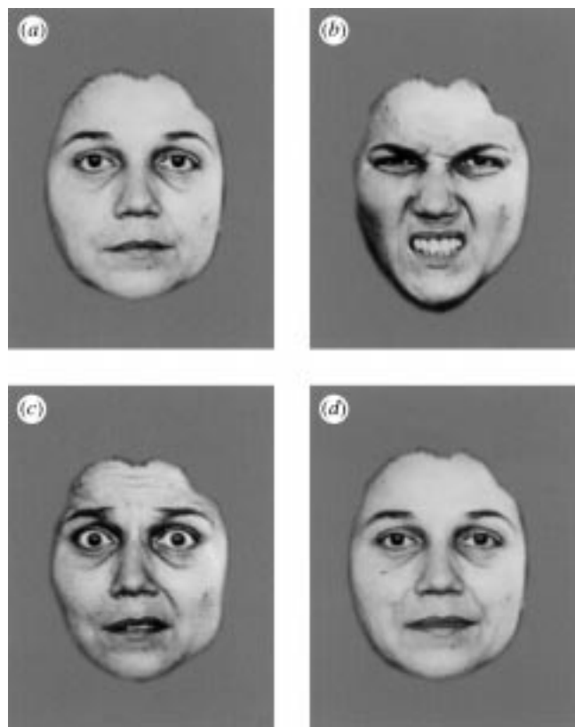
Figure 1. Faces from the standard set of Ekman & Friesen (1976). Examples of faces depicting 100% neutral (a), 100% disgust (b) and 100% fear (c) are demonstrated, along with an example of a stimulus depicting a mildly happy expression (75% neutral and 25% happy) (d) used as the emotionally neutral baseline condition in both experiments using facial stimuli.

The subjects were requested to decide the sex of each face or voice and press one of two buttons accordingly with the right thumb. The subjects were not informed that the purpose of the study was to examine the neural response to emotional stimuli. This sex-decision task has been used in previous studies investigating the neural response to emotional stimuli (Morris et al. 1996; Phillips et al. 1997) and allows an identical task and response across the four experiments. These studies have shown that the neural response to facial expressions of emotion does