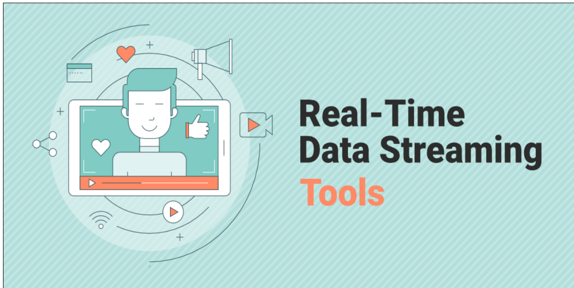
Figure 2 Real-Time Data Streaming Tools