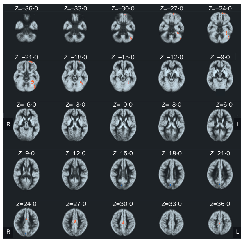
Figure 2: Grey-matter probability map for people who developed psychosis

Red regions denote areas of grey-matter reduction during follow-up, whereas blue regions denote areas of increase. Images are presented in standard radiological fashion, where right is left and vice versa. Z coordinate shows position of each slice with respect to the Talairach atlas. Clusterwise probability of type I error, p < 0.003 , meaning less than one false positive test is expected over the whole map.