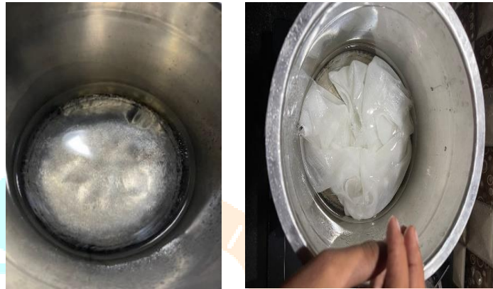
Fig.1 Immerse the Aloe Vera for the Mordant process

On preparation of dye bath, Pomegranate peel is added to water and boiled it in 100 degree Celsius later stirred it well. After 20-30 mins of boiling, once the color of the pomegranate peel is extracted the solution is filtered for 2-3 times to remove all the peel waste and other excess particles so that the patches do not occur. After filtration the fabric is dipped inside the dyed solution for 1 hour. The fabric is on movement during the dyeing process as the fabric will be treated equally.