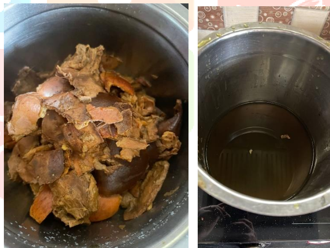
Fig.2 Adding pomegranate peel dye into water