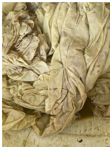
Fig.3 Immersing the fabric into dye

Once the fabric is immersed to the dye bath and the dye is set to the fabric. Take the fabric out wash to extract all the waste particles out and to make sure if the color doesn't fade. After the first wash, wash the fabric again to check the color fastness of the fabric. Later squeeze it well.