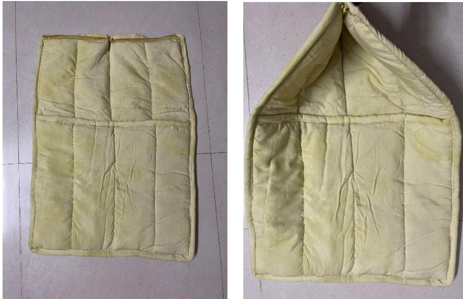
Fig.6 Final Product