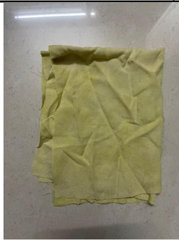
Fig.4 Pomegranate peel dyed fabric