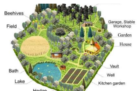
Fig -1: Permaculture Design for Eco-Village