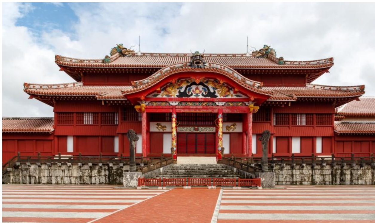
SHURI CASTLE, NAHA, OKINAWA, JAPAN.