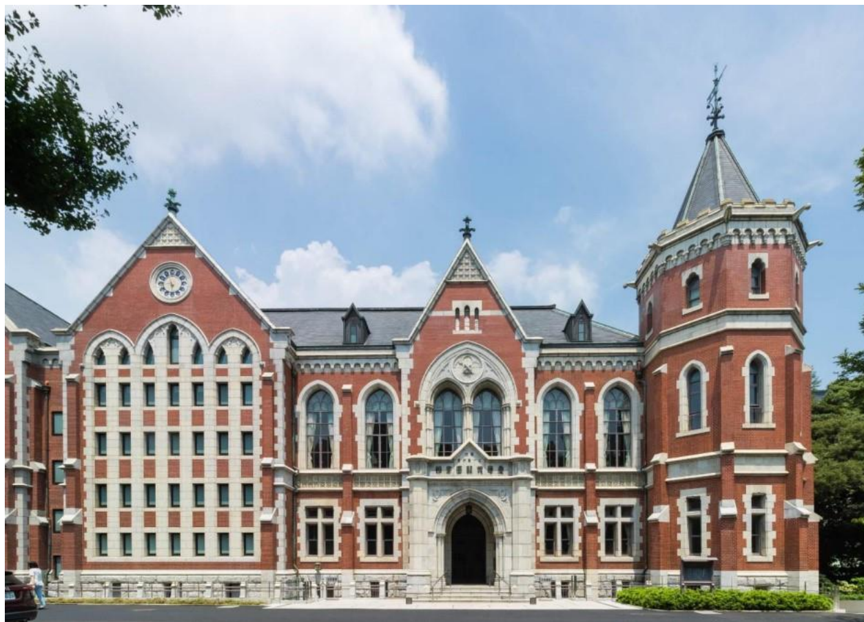
KEIO UNIVERSITY, JAPAN.

In 1929 , after much ideation and reflection, he additionally changed the name of Karate-Jutsu (Chinese-hand Karate technique) to Karatedo (the method for Karate, or the way for the empty hand). He, at that point, characterized the " Twenty precepts of Karate " and built a fantastic Karate reasoning. Finally, the method for Karate had made its mark and was picking up ubiquity the whole way across Japan.